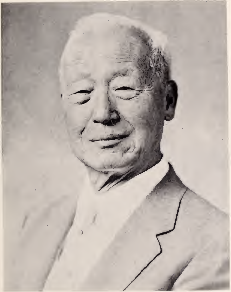
대한민국 대통령 리승만 박사